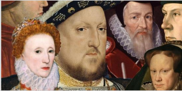
Photo: Tudor kings and queens